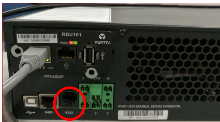
Figure 3 – RS-232 Port