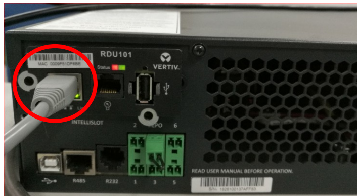
Figure 1 – Network connection to RDU101